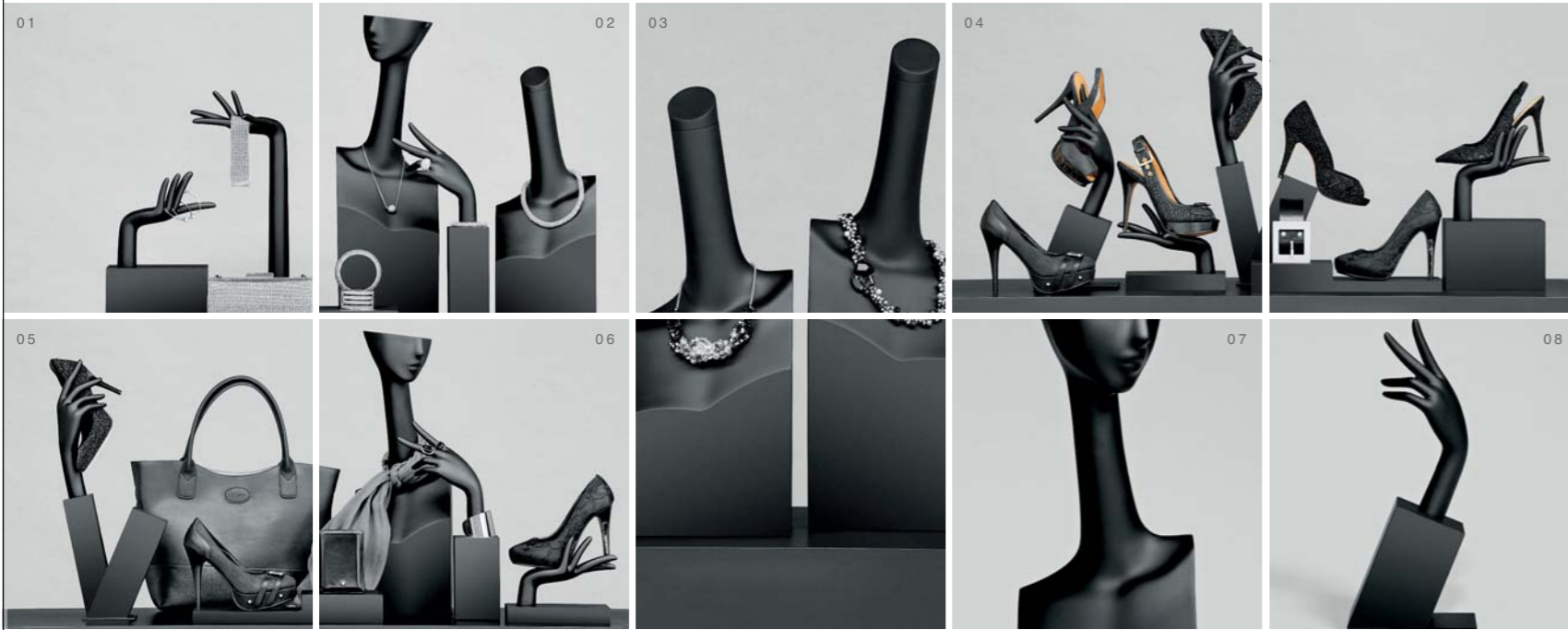
For references of products on this page see glossary

The ACCESSORIES series of forms and busts has been designed around the poetic lines and curves of the collection 60 SKETCH. A statement of beauty and refinement designed to present clothing collections, shoes, fashion accessories, jewelry and perfume... the extensive range of forms and hands allows you to compose any size of arrangement, projecting an image of style and quality.