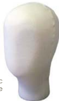
Head on display