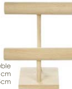
Double H 15+30 cm W 25cm