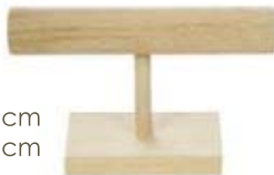
H 15 cm W 25 cm