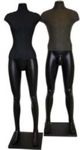
Ref D25L H25L