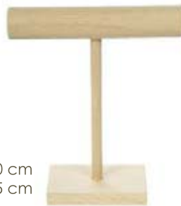
H 30 cm W 25 cm