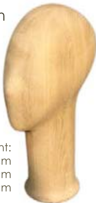
Neck height: 5cm 16cm 30cm